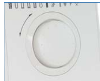
Electronic jog dial makes stitch selection quick and simple.