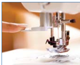
Easy Automatic needle threading