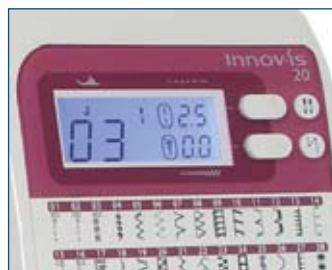
A clear LCD display showing important sewing information.