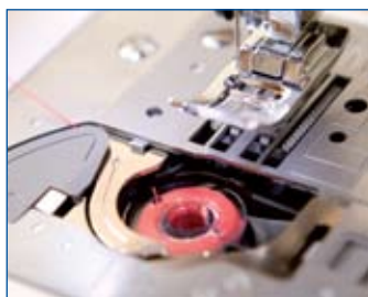
Quick set bobbin. Just drop in a full bobbin and you are ready to sew.

Fast sewing – Create with speed at up to 850 stitches per minute sewing speed.